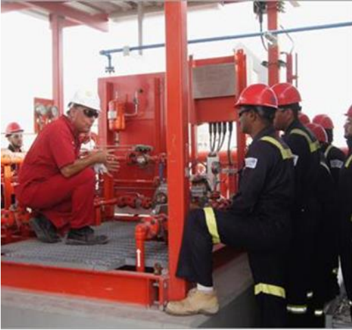
Fixed System Training