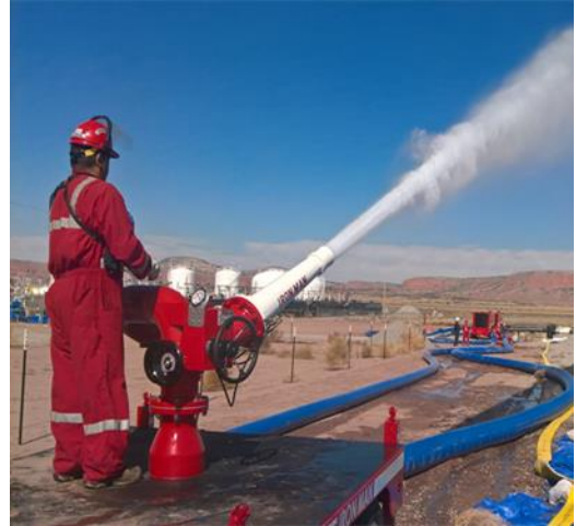
Big Flow Training

As National Foam is the manufacturer, we are best positioned to provide long term support for your equipment. We have fully qualified Designers and Engineers at National Foam who offer an exceptional and extensive depth of technical and hands on experience. We can support your project right through from design phase, all the way through to Commissioning with our staff, ensuring you have the best quality of pre and after care for your equipment.