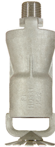
(Stainless Steel Model Shown)